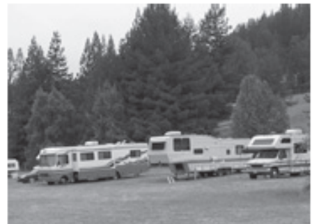
RV's and Tent Campers Welcome

SURF MOTEL (707) 964-5361 FOOLS RUSH INN (707) 937-5339 SEA FOAM LODGE (707) 937-1827