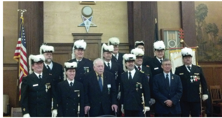
Knights Templar SLO Installation