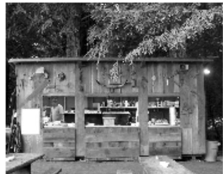
Comptche Cook Shack