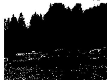
RV's and Tent Campers Welcome

SURE MOTEL (707) 964-5361 FOXY'S KUSH INN (707) 937-5340 SEA FOAM LODGE (707) 937-1827 COAST VACATION TRAILERS (707) 962-9294